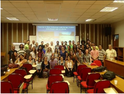
Introduction to Fluvial Geomorphology workshop, Rio de Janeiro