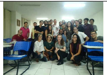
Introduction to Fluvial Geomorphology workshop, Recife