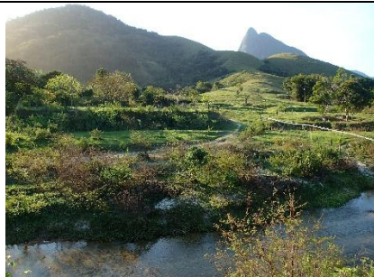
Partly confined, planform controlled, low sinuosity, terrace constrained, gravel bed River Style – Macaé catchment