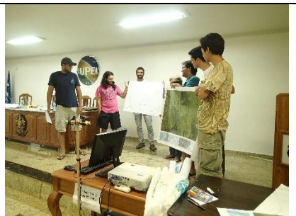
Presenting river evolution and forecasting of river futures in Macaé catchment