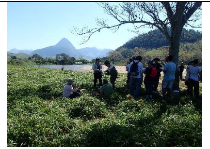
Laterally unconfined, continuous channel, meandering, sand bed River Style – Macaé catchment