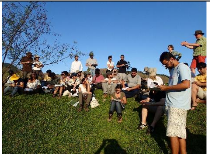
Identifying geomorphic units and interpreting river behaviour in the field – Macaé catchment