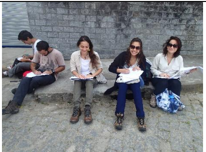
Completing River Styles assessments in the field