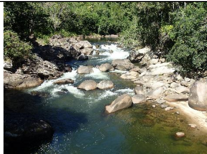
Confined, bedrock margin controlled, occasional floodplain pockets, boulder bed River Style – Macaé catchment