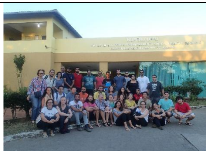
River Styles Short Course participants