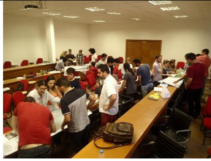
Mapping River Styles on the short course