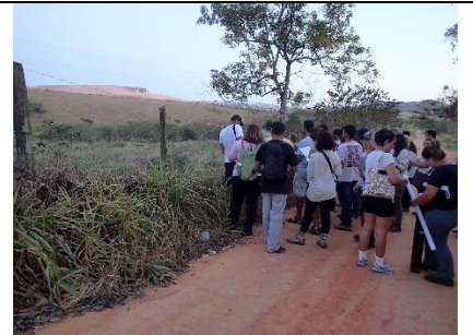
Laterally unconfined, discontinuous channel, valley fill, fine-grained River Style – Macaé catchment